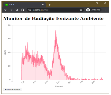
Figure 3. MCA web application in development

At regular time intervals, the spectrum is read from the BRAM and sent via a radio-frequency modem to a dedicated server in an indoor location far from the monitoring station. A web application was written in JavaScript language to receive the spectrum data and plot it in a HTML page. Figure 3 shows an example of a spectrum measured from gamma emissions of a <sup>137</sup>Cs source. The current design phase is focused on battery management and radiofrequency communication protocols.