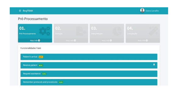
Figure 2. ReqFRAM main interface.