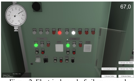
Figure 2. Electrical panel of oil pumps and malfunction menu

To meet the planned maneuvers, a menu of malfunctions was created [2] shown in Figure 2.