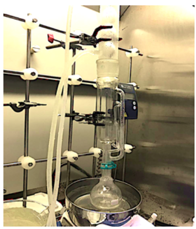
Figure 1. New synthesis apparatus for production of the radiotracer CH<sub>3</sub>I labeled with radioiodine.

The online detection of leaks in industrial heat exchangers is one of the most used industrial radiotracer techniques. To locate leaks in a heater exchange located in oil and gas offshore platforms, the radiotracer must have a half-life large enough to allow its transport from the supplier to the offshore platform and a gamma energy high enough to cross the walls of the industrial unity. Because CH<sub>3</sub>I labeled with radioiodine satisfies these conditions, it was selected as the radiotracer to be used to locate leaks in high-pressure heat exchangers in oil and gas offshore platforms. [1,2,3] In a new apparatus, shown in Figure 1, the methyl iodine radiotracer is produced by reacting dimethyl sulfate with NaI<sup>123</sup> [4,5]. It is a conventional Soxhlet extractor and was modified to guarantee safe operations with radioactive isotopes.