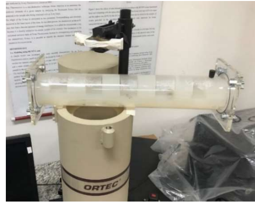
Figure 2. Experimental wave form scheme.

measurements, and their results were placed in the production set of the ANN, after the ANN had been trained.